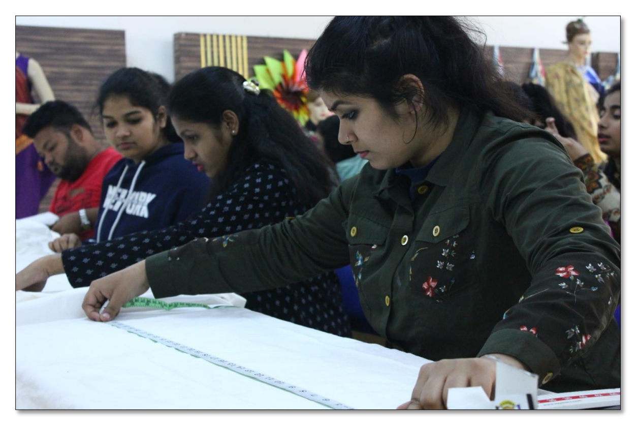
Students preparing the Fabric for Smocking effect/ design in workshop